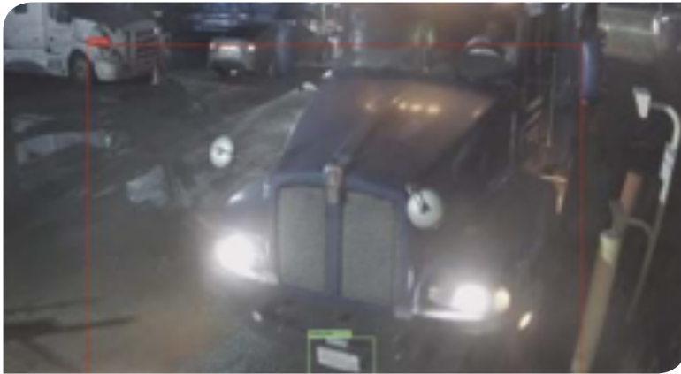
Above: The technology is not thrown when reading licence plates in the dark.

the plant could advise customers to avoid certain times. If on-site staff are unwittingly causing delays, there can be optimisation at the cement plant. Maybe there should be a 'gentle nudge' to the driver for sleeping on the job. Maybe the event was a complete one-off and no action need be taken.