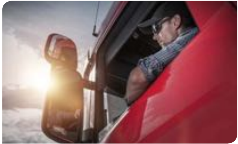
Above: In a crowded market, cement companies are increasingly focused on customer experience. Nobody wants to wait for product.

JF: The algorithms can detect truck license plates, can tell the difference between people, tractors, trailers and cars and identify different colours. For every vehicle on site, the system generates a digital twin so it can keep track of its movements. Every time the vehicle is detected by the system it updates its records. Think of it like a 'facebook profile' for the vehicle. Every time the vehicle does something, there is a 'status update' in its 'news feed'.