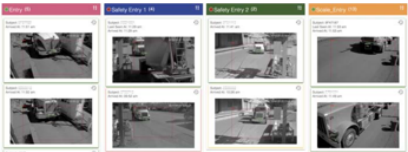
Below: Atology's Yard View enables operators to see an overview of each point of interest in their camera network.

With the proper diagnosis from the data, action can be taken. If the root cause was high traffic levels,